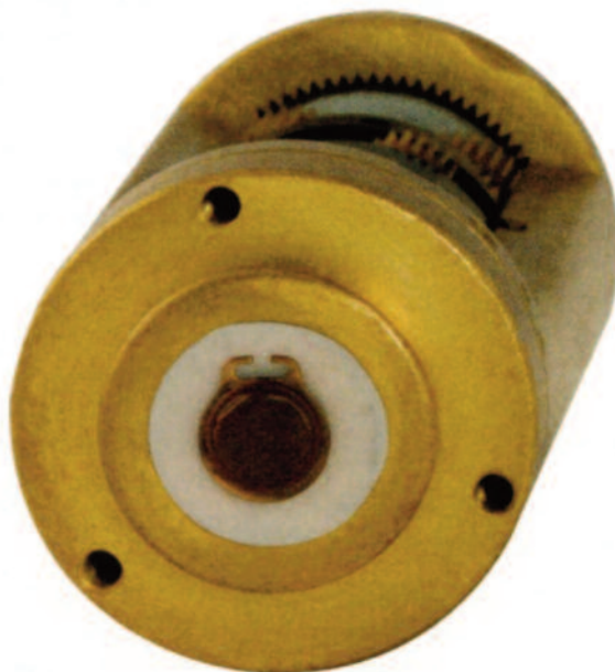
Precipart was contracted to produce a custom design using non-magnetic materials for a national research laboratory.

While this seems simple enough, just because a part is called standard does not imply that it is in stock. It means that its specifications are standard and often the manufacturer must schedule and produce an order. Since this may not meet the desired timetable, a custom alternative still may be worthwhile. It may fulfill the requirement better within a suitable schedule.